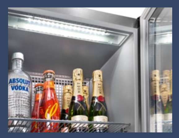
For an attractive presentation the CMes 502 is equipped with a separately controllable, dimmable LED lighting . It is fit flush to finish in the ceiling thus space-saving.

Be it for your bedroom, entertainment room or a soho office, the Liebherr CMes 502 is the innovative appliance for making your refrigerated storage requirements truly convenient.